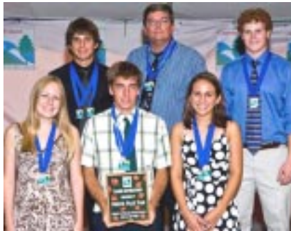
The 2007 Envirothon Team.