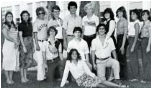
1981 National Honor Society

Your 25th class reunion is this summer. Please contact the school if you would like to help plan the events.