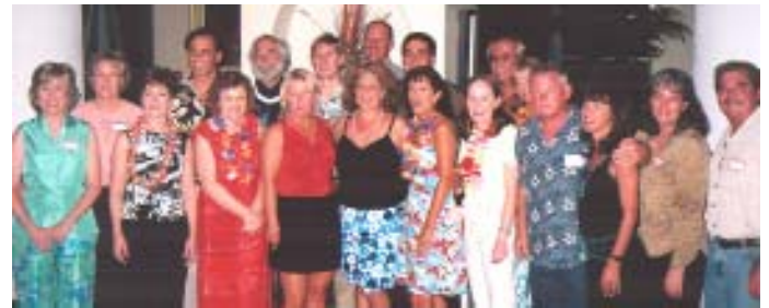
The class of 1975 celebrating their Luau at Gator Trace.