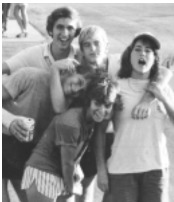
1984, Students on the field