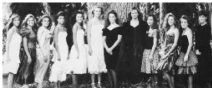
1989, Homecoming Court

Custom signs will be displayed at each event that you or your company sponsors, and your name will be mentioned during each public address announcement throughout the weekend.