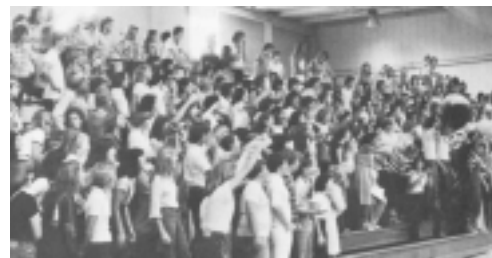
1978, Pep Rally in the gym