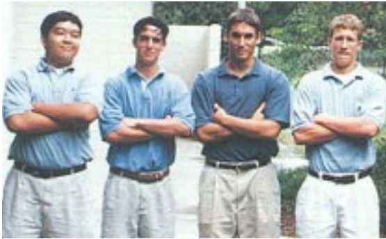
1998 Class Officers

The class of 1998 is having its 10-year class reunion this summer!