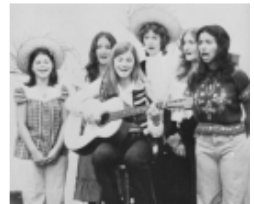
1974, Students having fun