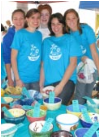
Students volunteer with the Empty Bowl Project to raise money for the Treasure Coast Food Bank.

During the penitential season of Lent, we are called to a greater awareness of the Passion and death of our Lord, Jesus. We strive to turn away from sin and to participate in the cross of Christ in a meaningful way. Hopefully as we do so, we also adopt Lenten practices such as prayer, fasting, and alms giving. We do these things so that we may truly prepare our hearts and our minds for the joy of Easter, for the wonderful celebration of Easter!