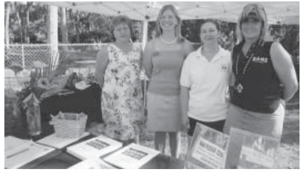
Thank you to the volunteers who helped with the Alumni Tent!

If you were not able to participate in the above events, don't worry... we have several more on the horizon. The 2005-2006 Mega Drawing kicked off December 5th and will run through February 3rd. The Mega Drawing is a chance for you to win free tuition, a trip to Europe, or more than $3,000 in cash prizes. I have enclosed a pack of tickets in this mailing for your convenience. Please complete the right hand portion and return the tickets and payment in the self-addressed envelope. Last year the Mega Drawing raised a net income of nearly $30,000, and we hope to increase that amount this year.