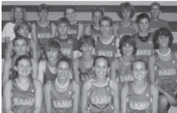
The talented Cross Country team takes a break for team photo.