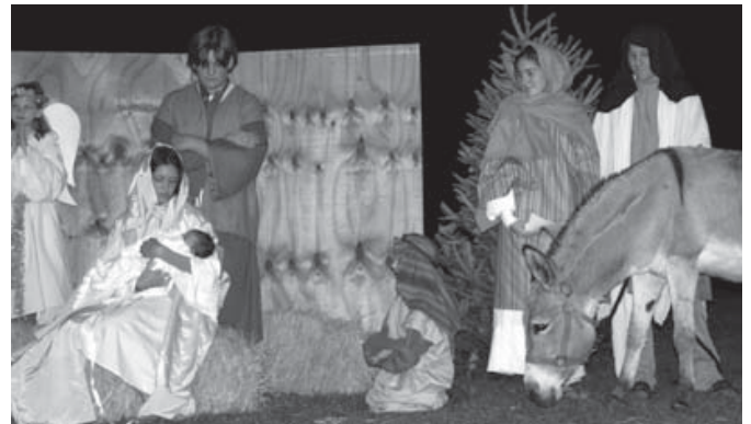
A living nativity was celebrated at the Christmas Festival.

Thank you for your support of the John Carroll/St. Anastasia Christmas Festival event. We are excited about our upcoming 300 Club Dinner, Dance and Auction! Your continued support and stewardship of time, talent, and treasure really help our faculty, staff, and school make a real difference in the lives of our students. Thank you so much.