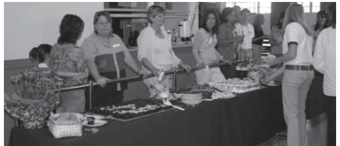
Parents' Guild volunteers help serve food at Open House.

The first half of the school year has flown by, and we are well on our way to the best parent participation yet! Thanks to all of the volunteers who made the reception for Open House a HUGE success! Countless people baked delicious desserts, donated drinks, or gave up their Sunday to serve prospective students and their families. It was beautiful, and your time and efforts are appreciated.