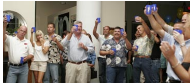
The Class of 1986 toasts to a wonderful reunion.